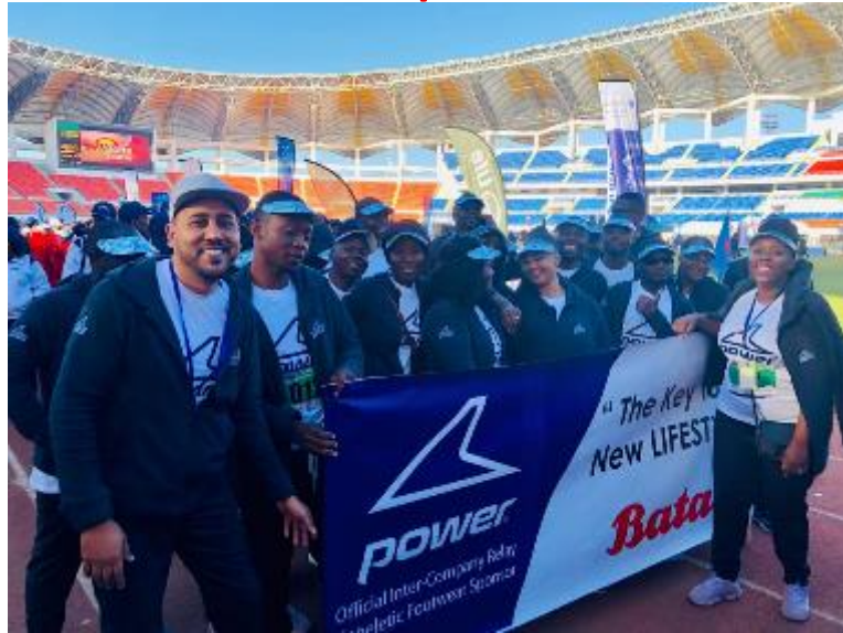
Team Power parade