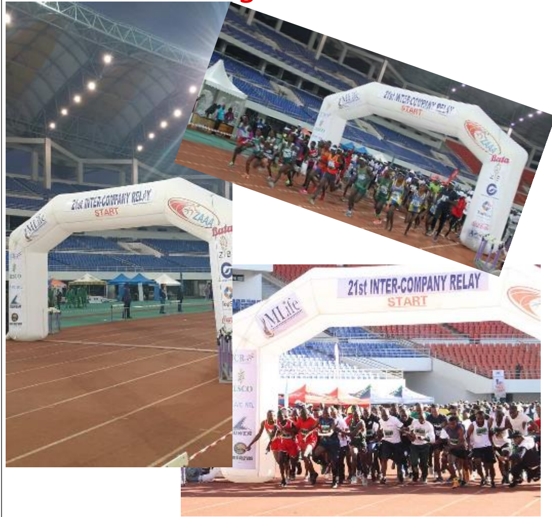
Power Race Begins